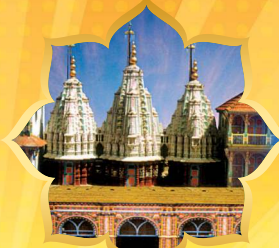
Bhuj Temple Shree Narnarayan Dev VS 1879 (1823 AD)