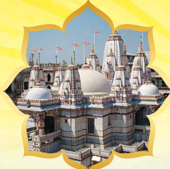
Vadtal Temple Shree Laxminarayan Dev VS 1881 (1823 AD)