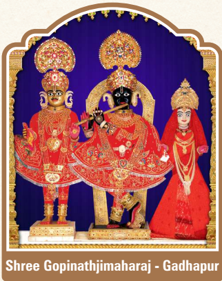
Shree Gopinathjimaraj - Gadhapur