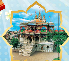
Gadhada Temple Shree Gopinathji Maharaj VS 1885 (1828 AD)