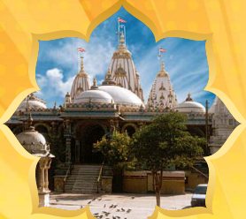
Ahmedabad Temple Shree Narnarayan Dev VS 1878 (1822 AD)