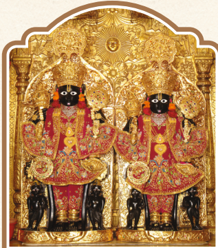
Shree Narnarayan Dev - Ahmedabad