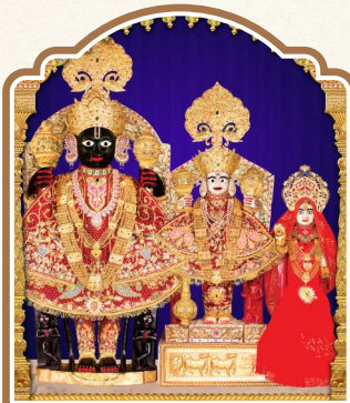
Shree Laxminarayan Dev - Vadatal