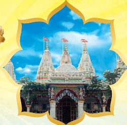
Dholera Temple Shree Madanmohanji Maharaj VS 1882 (1826 AD)