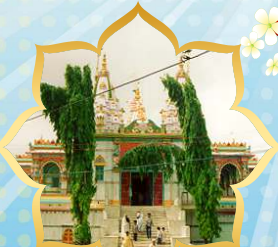
Junagadh Temple Shree Radharaman Dev VS 1884 (1828 AD)